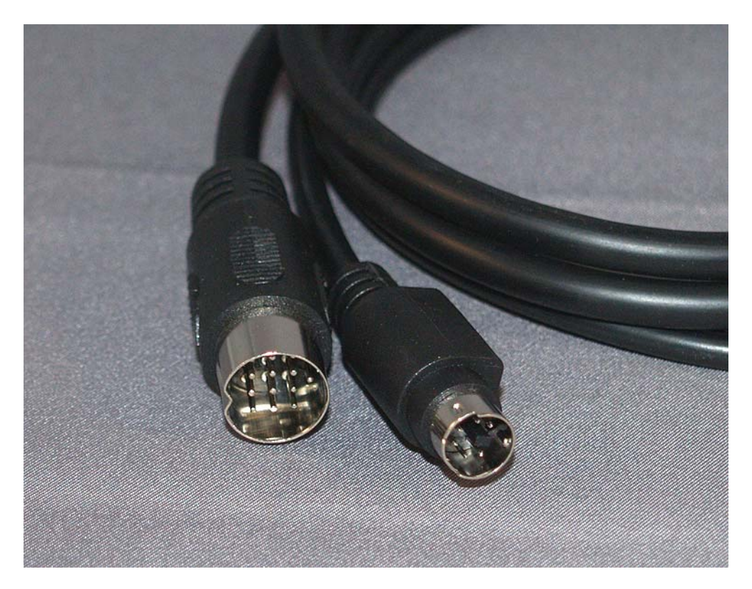
The provided cables connect the RCA-14 to the appropriate jack on your transceiver. You can use the DIN-13 cable alone, the DIN-8 or DIN-6 alone, or both the DIN-8 and DIN-6 at the same time.

or outputs as needed. The path from the interface cable to the corresponding Output jack is a straight-through, direct connection; any signal that appears an interface port pin will appear on the corresponding Output jack, and vice-versa.