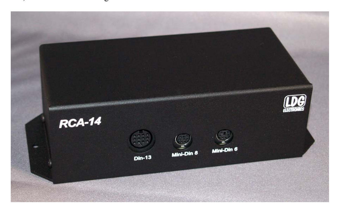
The RCA-14 front panel has three transceiver interface ports: DIN-13, DIN-8 and DIN-6, supporting most popular transceivers. Cables for each are provided.

Your RCA-14 is a quality, precision instrument that will give you many years of outstanding service; take a few minutes to get to know it.