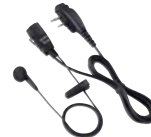
HM-166LA Light weight earphone microphone