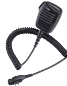
HM-159LA Full size durable speaker-microphone