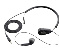
HS-97 + VS-4LA or OPC-2004LA* Throat microphone with earphone

* Either VS-4LA or OPC-2004LA is required when using HS-97 headset. VS-4LA: PTT switch cable for manual PTT operation OPC-2004LA: Plug adapter cable for VOX hands-free operation HS-94 and HS-95 also can be used with either VS-4LA or OPC-2004LA.