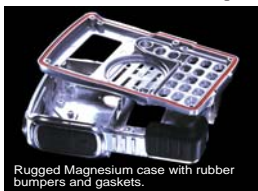
Rugged Magnesium case with rubber bumpers and gaskets.

The unmatched ruggedness of the VXA-710 is coupled with ultra-light weight, thanks to the die-cast magnesium case and chassis construction. Rubber bumpers on the bottom corners of the case protect it against damage from every-day bumps and scrapes.