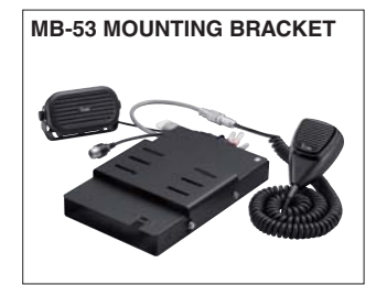
For mounting the IC-A210E. External speaker (SP-35) and microphone (HM-176) are included.